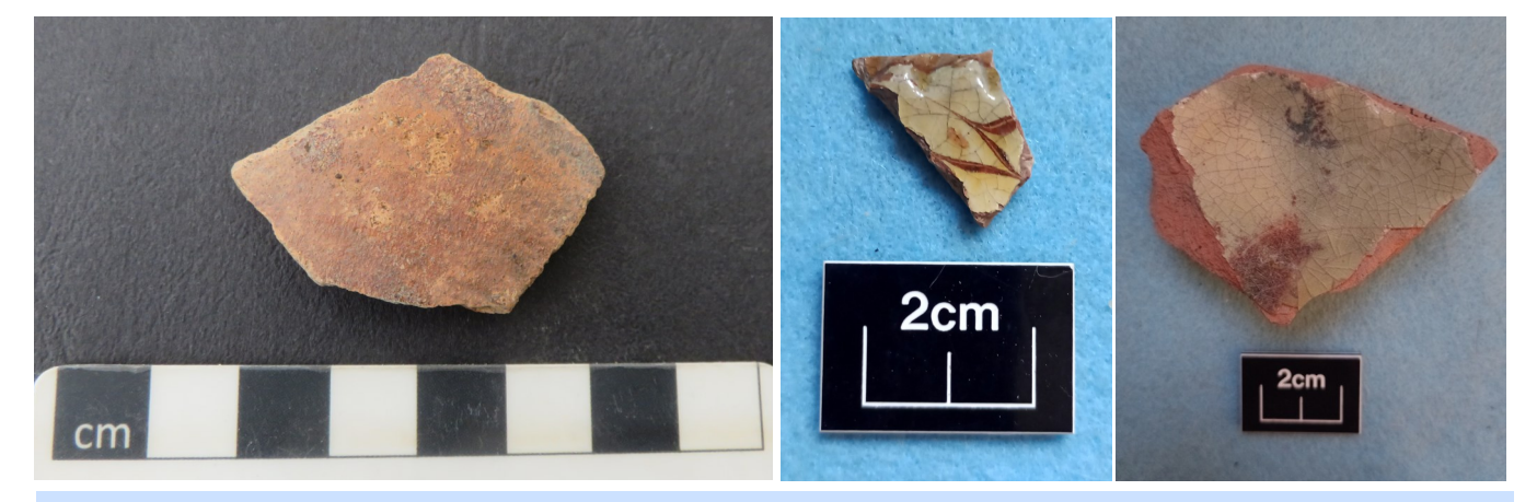
Fig 1. The sherd of 14th-15th century Scottish Redware from the primary phase pen, left; a pie-crust rim-sherd, middle; a basal angle sherd of Slip Glazed Redware of 17th/18th century date, right.

The pottery analysis by Derek Hall has been a vital element in helping to date the sequencing of the various phases of activity on the site. He has shown that the pottery assemblage indicates a late medieval phase in the occupation of the site, despite the limited number of medieval structures excavated. The pottery from Trench 7 included 9 sherds of Scottish Redware dating to the 14th-15th centuries including one from a layer within the primary phase pen in the corner of the yard. 17th-18th century Scottish Post-medieval Oxidised Wares and Slipped Redwares were found under the west wall of the byre confirming the dating suggested by the clay pipe from the make-up layer on which the byre was constructed, but 19th century pottery indicated that the wall was rebuilt (Fig 1).